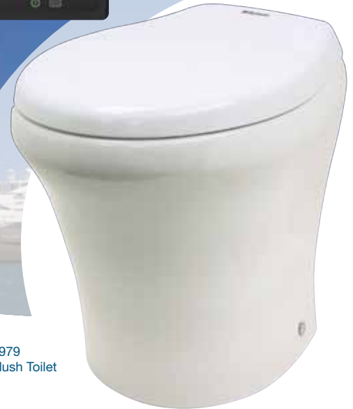
Model 8979 MasterFlush Toilet

One luxurious look – with many designer-friendly options. That summarizes the distinct advantage of SeaLand 8900 series macerator toilets powered with MasterFlush® technology.